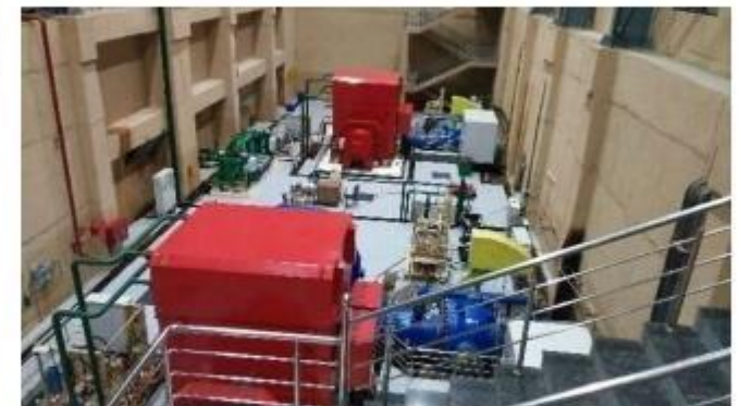
Hydro TG Set