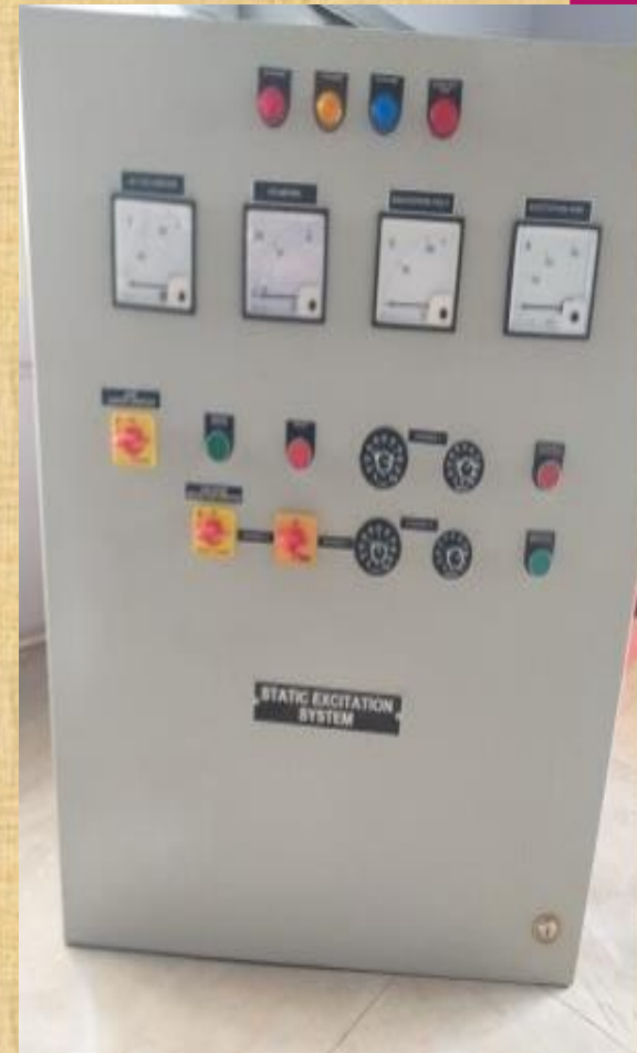
Static Excitation System