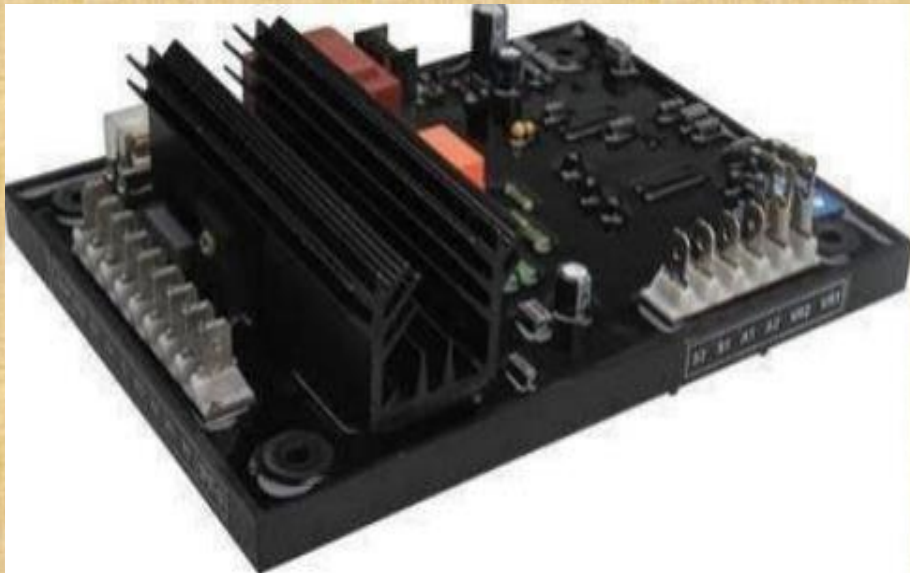
Analog Type AVR