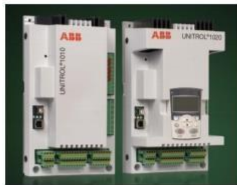
Unitrol 1010 Unitrol 1020